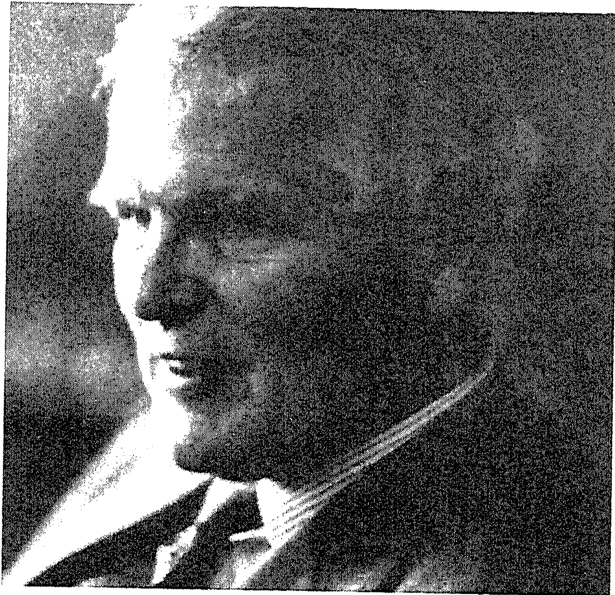
Figure 1. R.E. Kalman.

to problems of control, communication, signal processing, and computing.